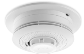
COVERPLATE shown with PROSIXSMOKEV